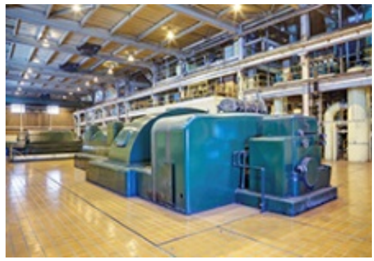
Figure 1: Electrical power turbine generator set

Infrequent procedures such as purging hydrogen gas from electric generators and bushing boxes call for employers to pay special attention to safety. Employers must provide adequate training and ensure that workers comply with safe work practices and written procedures before beginning the task. This SHIB highlights this need and includes a case study about a fatal flash fire that resulted from inadequately purging a hydrogen gas-cooled electric generator housing and bushing box.